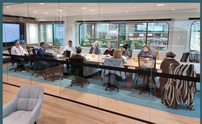
ReadiNow host clients and industry professionals across a series of interactive CPS 230 Roundtable Sessions held at the ReadiNow Innovation Centre in Sydney.